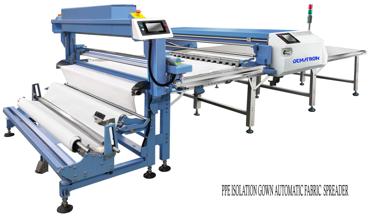
PPE ISOLATION GOWN AUTOMATIC FABRIC SPREADER