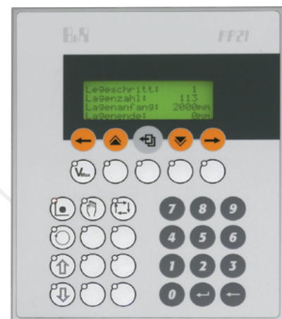
(CANBUCON 1 controller)